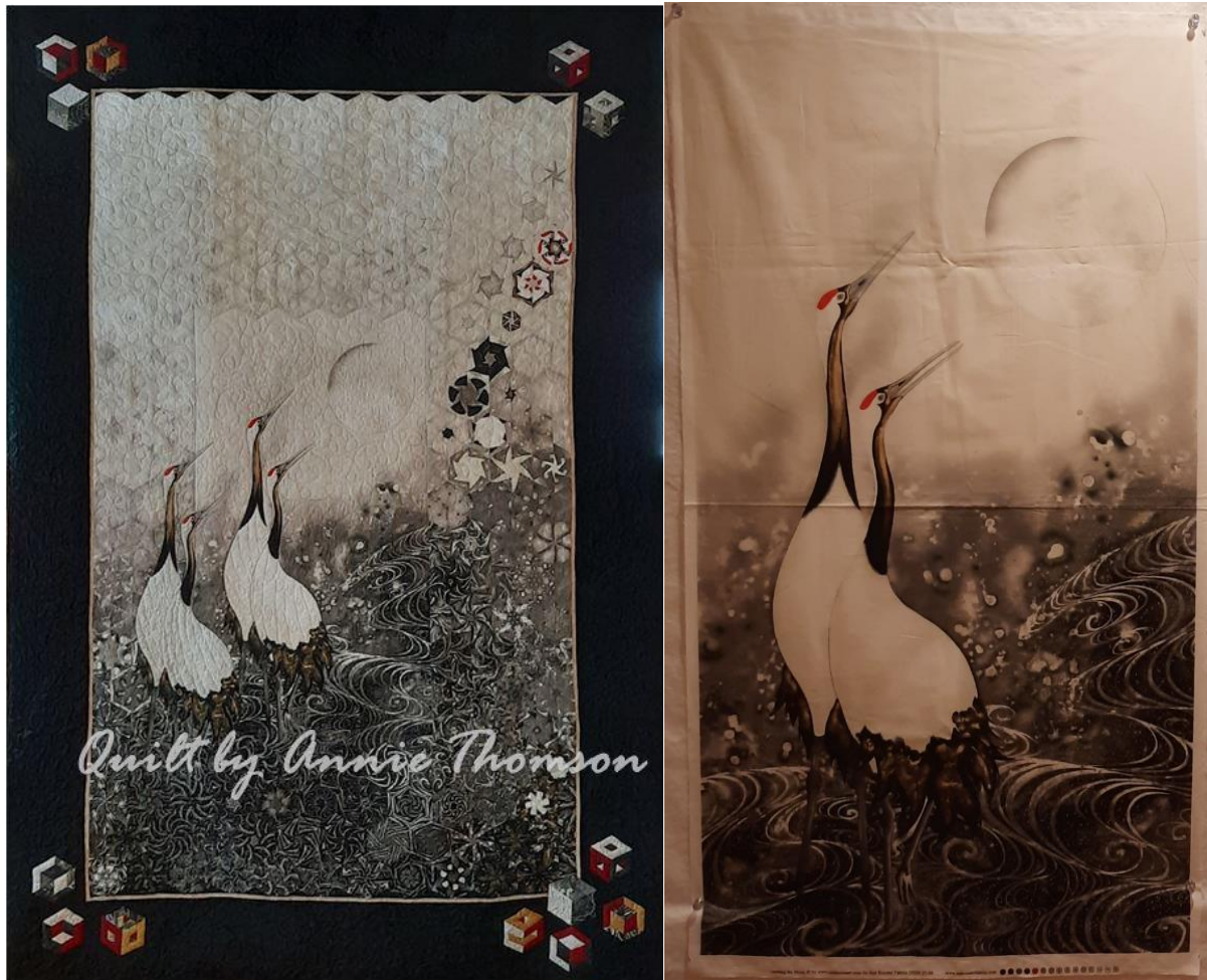
Completed quilt and the original panel, side by side