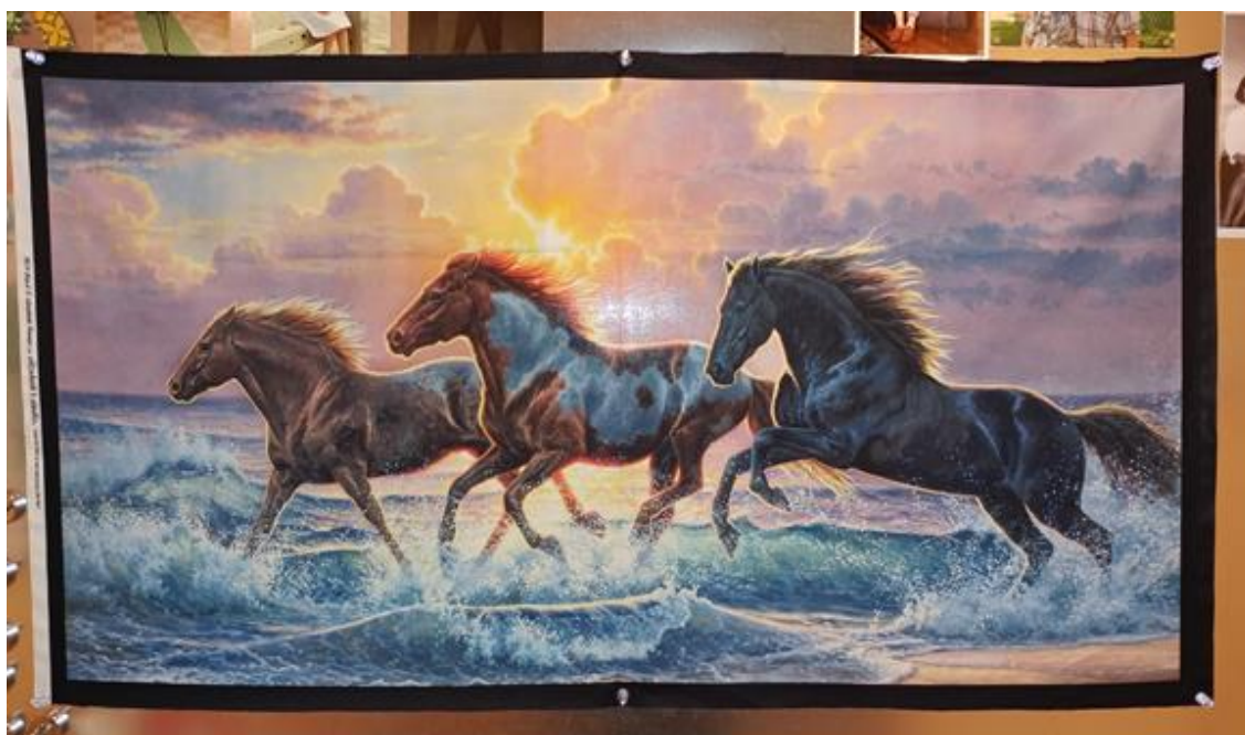
Original Panel for the quilt above