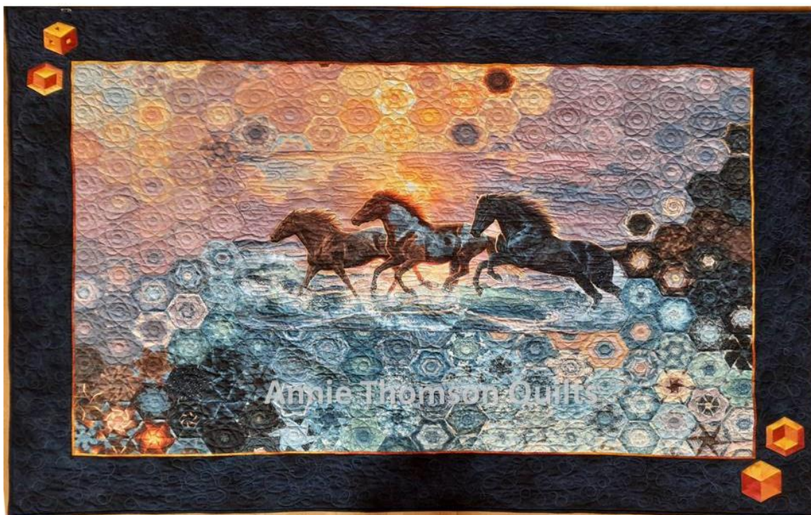
Gifted to my sister-in-law