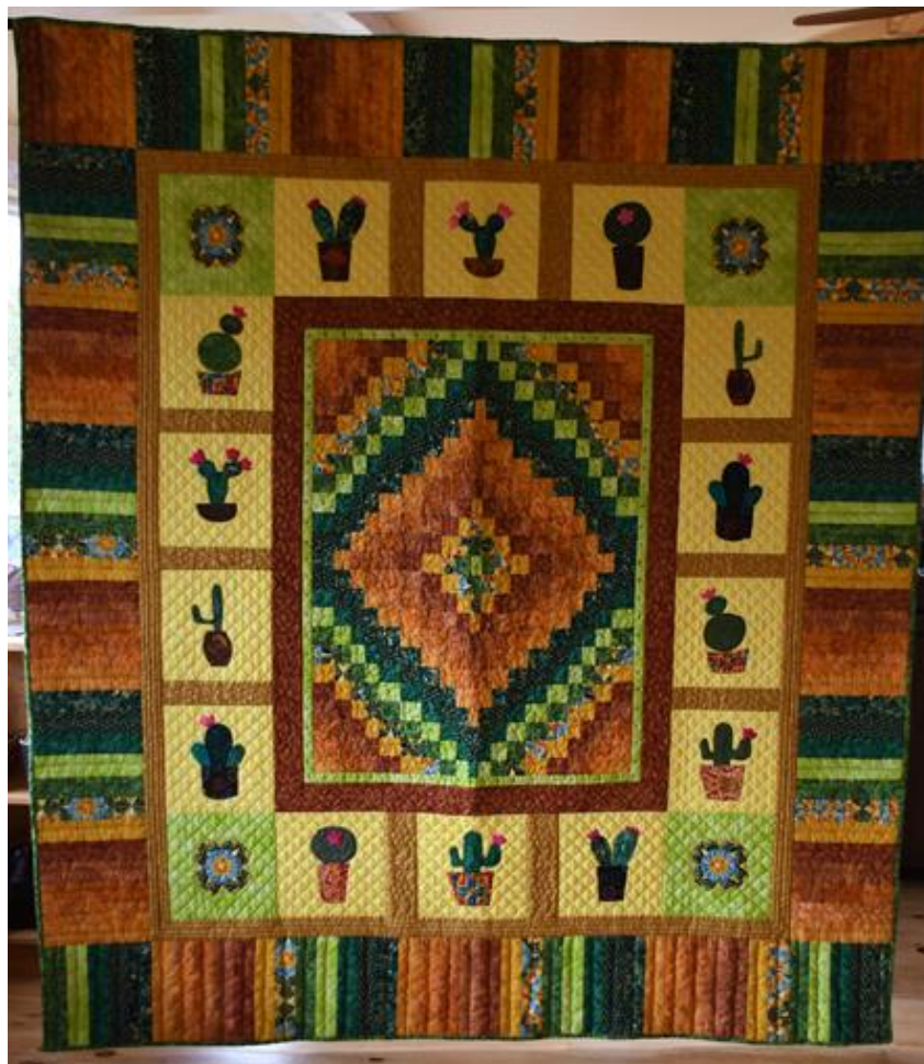
Gifted to my niece

The quilt below is a quilt I completed for my niece for her 16 th birthday and the last one in a big group of nieces & nephews to get a quilt on their 16 th birthday... amen to that! She asked for a quilt with the theme of “succulents” and specified the colors of green and brown to be in her quilt. Below is what I came up with for her and the quilting was completed with a combination of hand-quilting, machine quilting and decorative stitches. The bargello center was from one of the workshops the Guild had a couple of years ago and I finally completed it to include in this quilt.